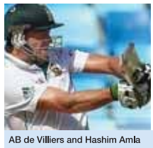
AB de Villiers and Hashim Amla

Roach was surprisingly not given the new ball and runs flowed freely from South African openers Alviro Petersen and Dean