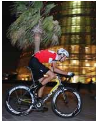
Action from the opening day of Tour of Zubarah in Doha yesterday.

"I am fully fit. Every rider has prepared well. You know the Tour of Zubarah has grown in just one season. The riders look forward